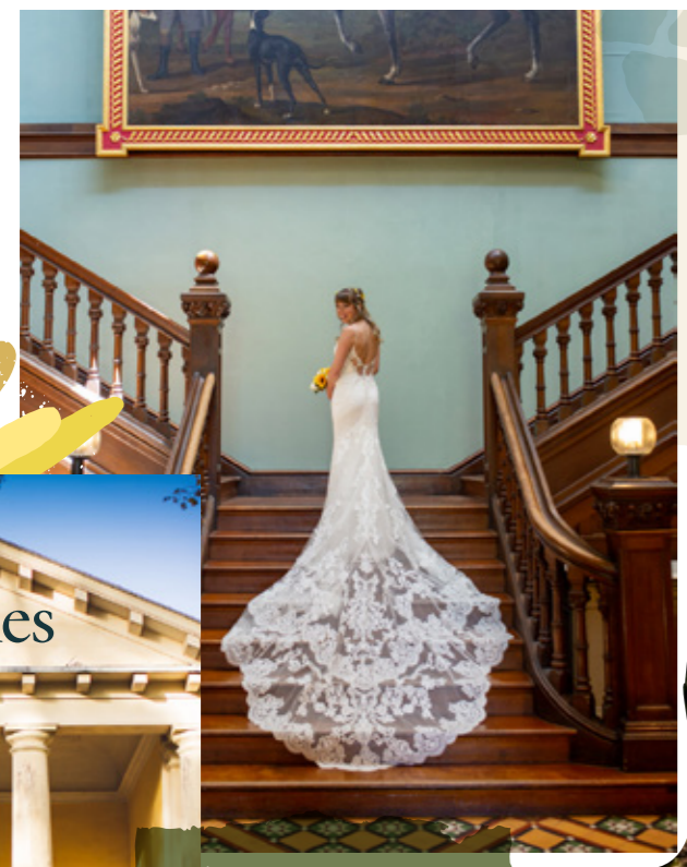
17th century hall and atmospheric rooms in Hestercombe House