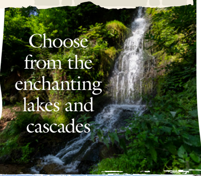
Choose from the enchanting lakes and cascades