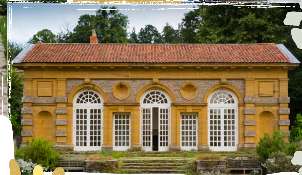
Charming historical orangery