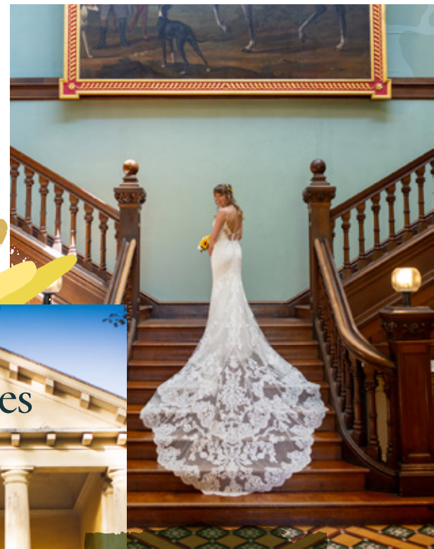
17th century hall and atmospheric rooms in Hestercombe House