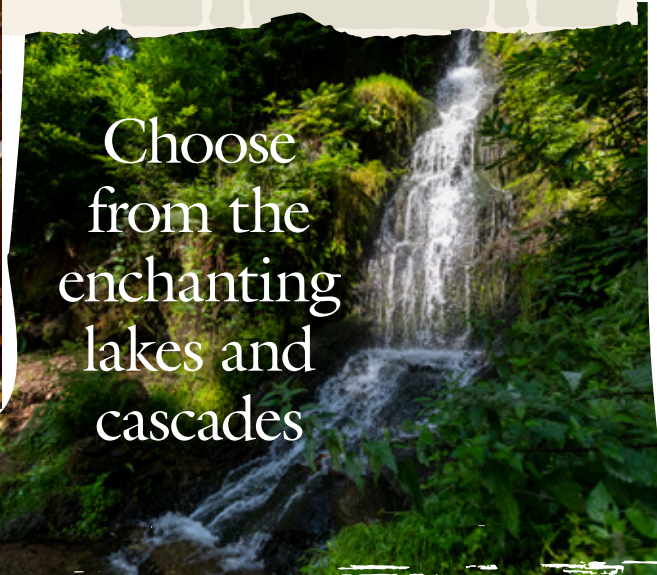
Choose from the enchanting lakes and cascades